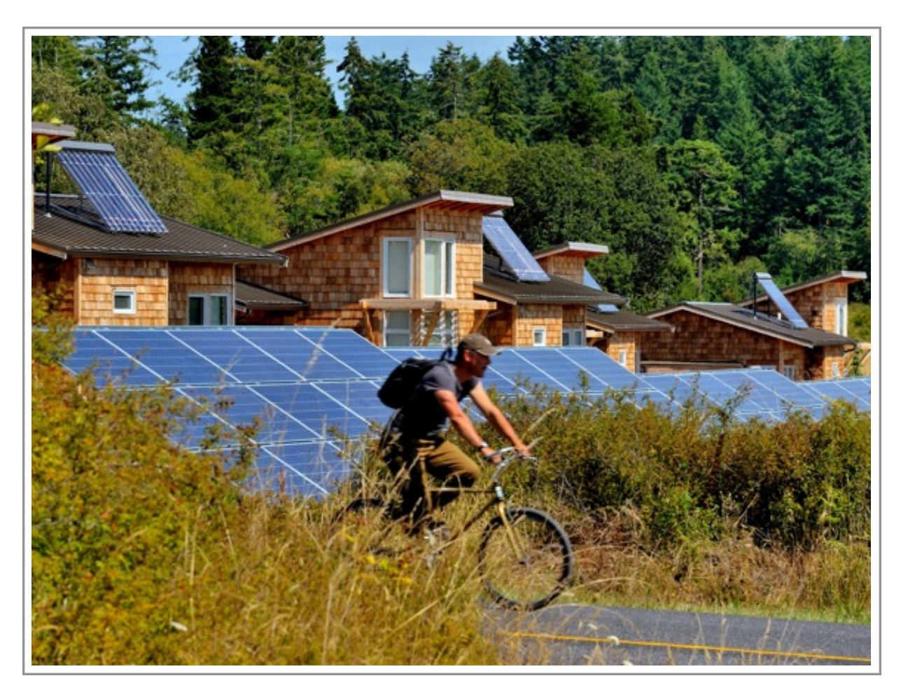
National Community Land Trust Network